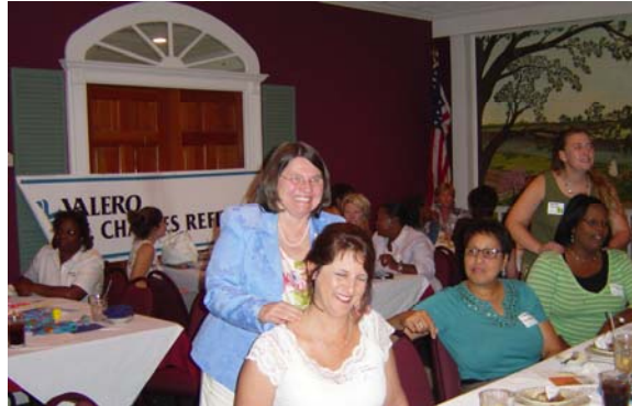
Women's Seminar—July 2007, Bull's Corner

members-only events to hear updates and discuss timely issues face-to-face with area leaders and elected officials.