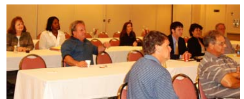
DISC Seminar Participants